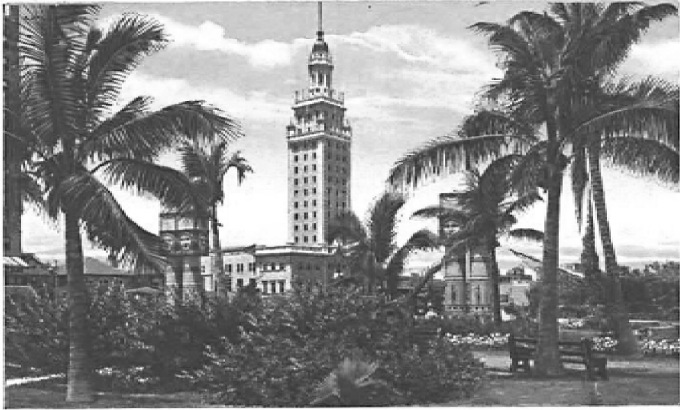
MIAMI DAILY NEWS TOWER, MIAMI, FLORIDA